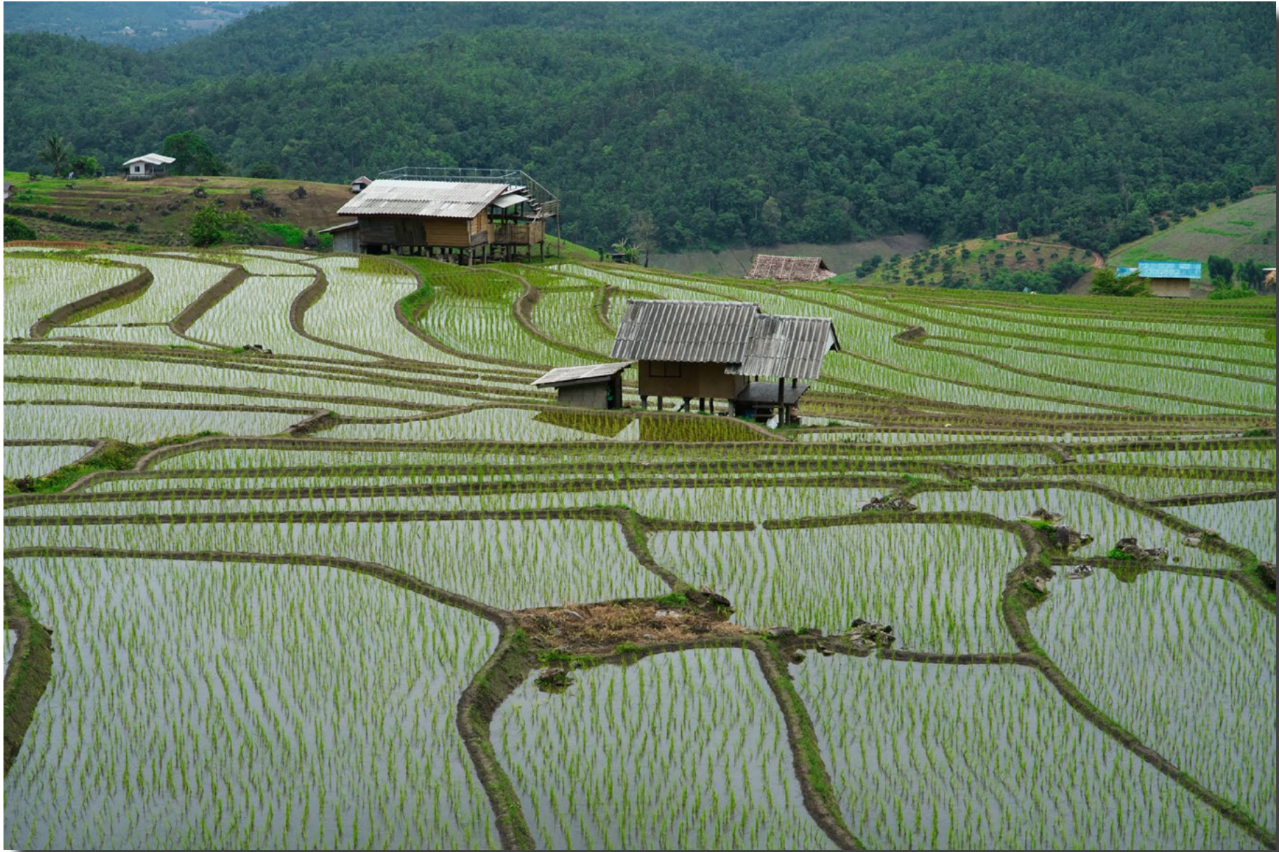
Newly planted rice fields, Ban Pa Pong Piang, Chiang Ma