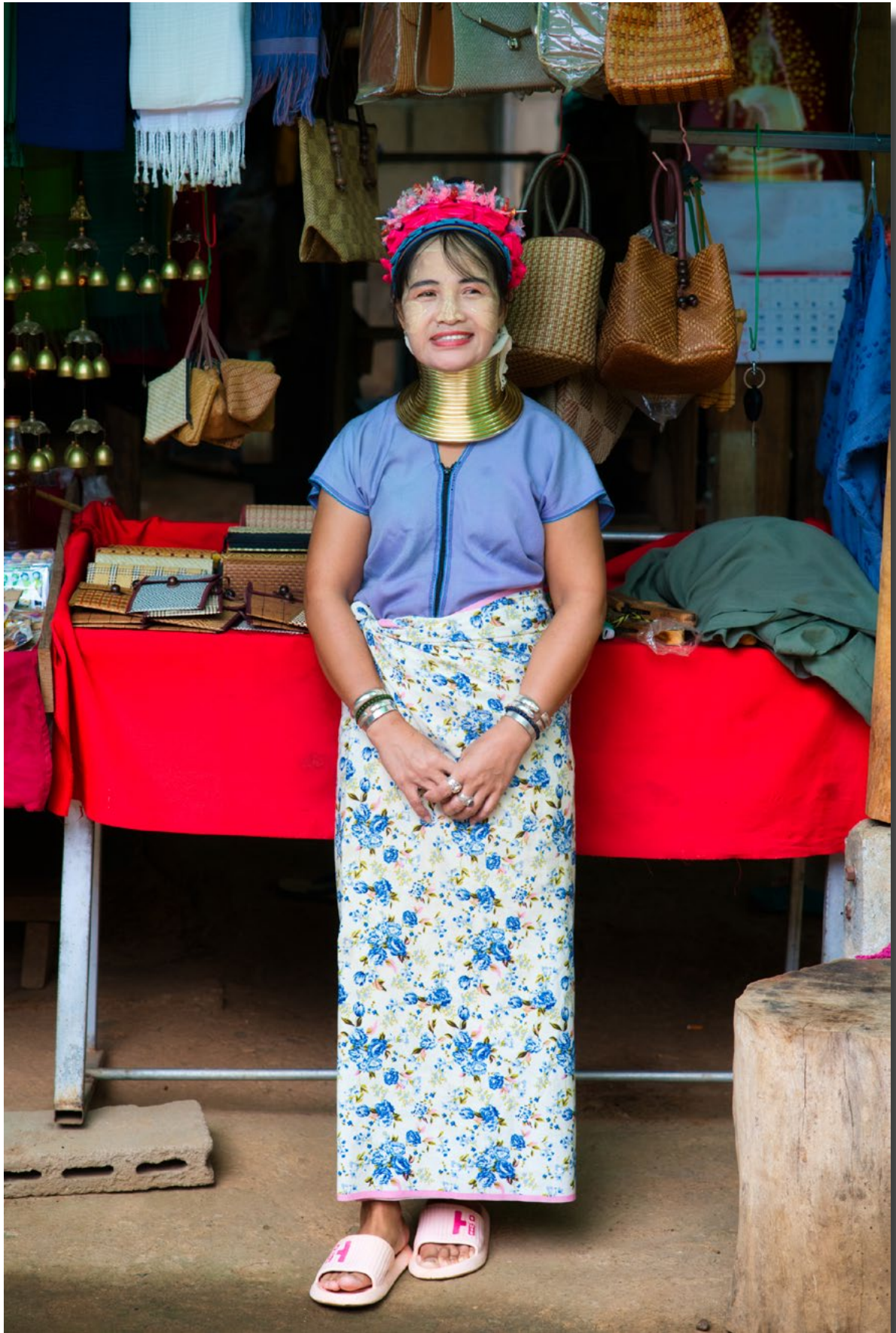
Karen Long Neck Village, Ban Huai Suea Thao, Mae Hong Son