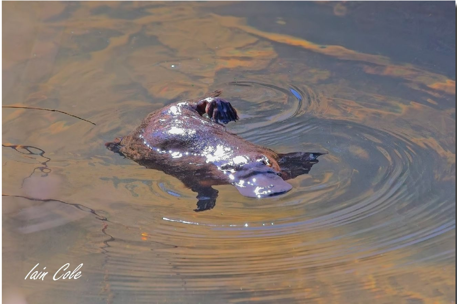
Find that Itch!. Platypus scratching at Broken River Iain Cole