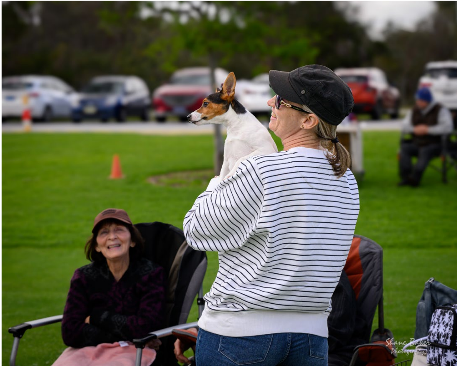
Dog show entrants, Perth Nikon Z9 with Nikkor Z70-200mm at 70mm, 1/1250sec at F/5.6 and ISO560 Shane Baker