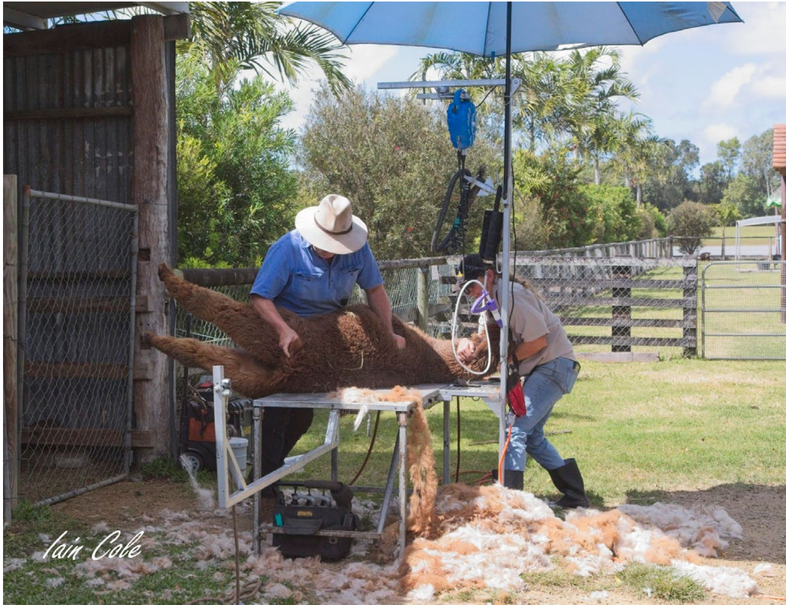
- The alpaca in question. Iain Cole