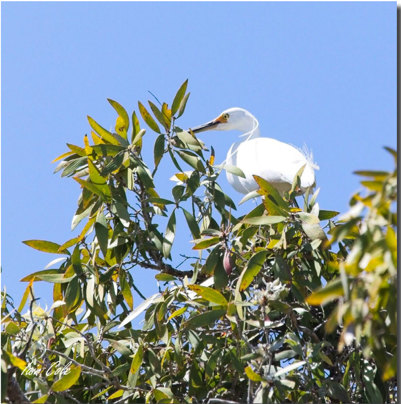
T's the season. Great Egret in mating plumage, Munjunga Iain Cole