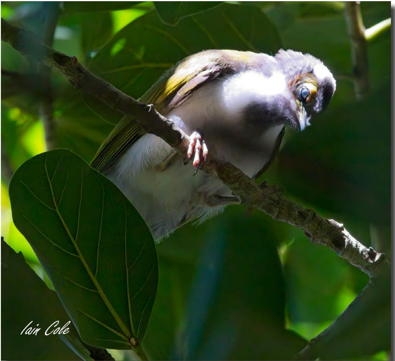
This way lies madness. Juvenile Blue Headed Honeyeater about to monster a Spangled Drongo Iain Cole