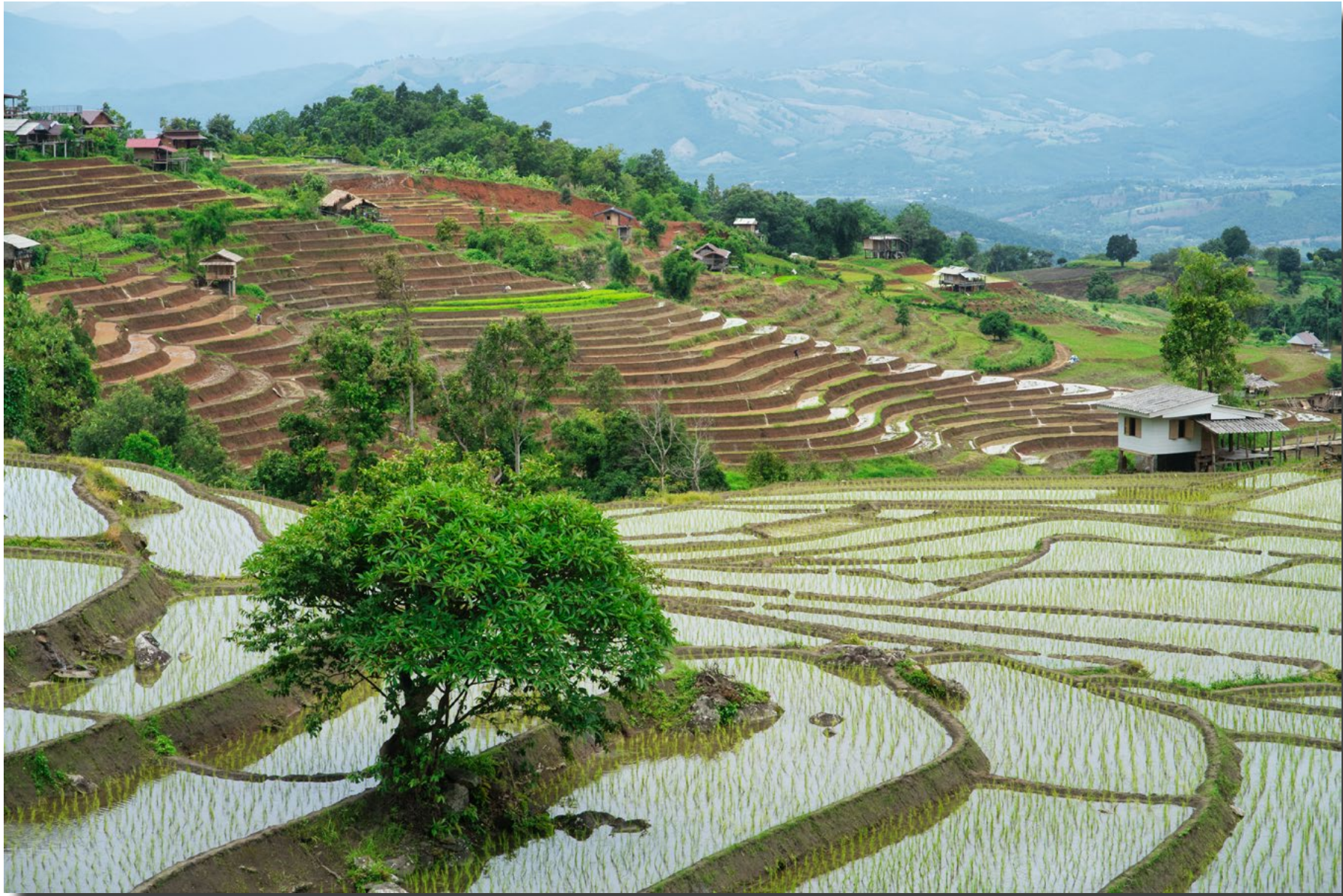
Rice field terraces, Ban Pa Pong Piang, Chiang Mai