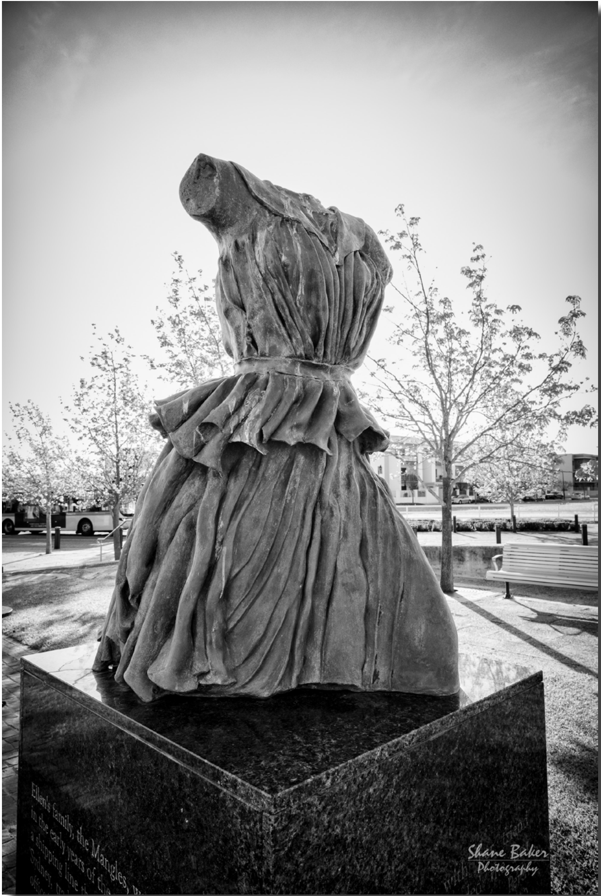
Ellenbrook statue Nikon Z9 with Nikkor Z24-70mm at 24mm, 1/125sec at F/11 and ISO1000