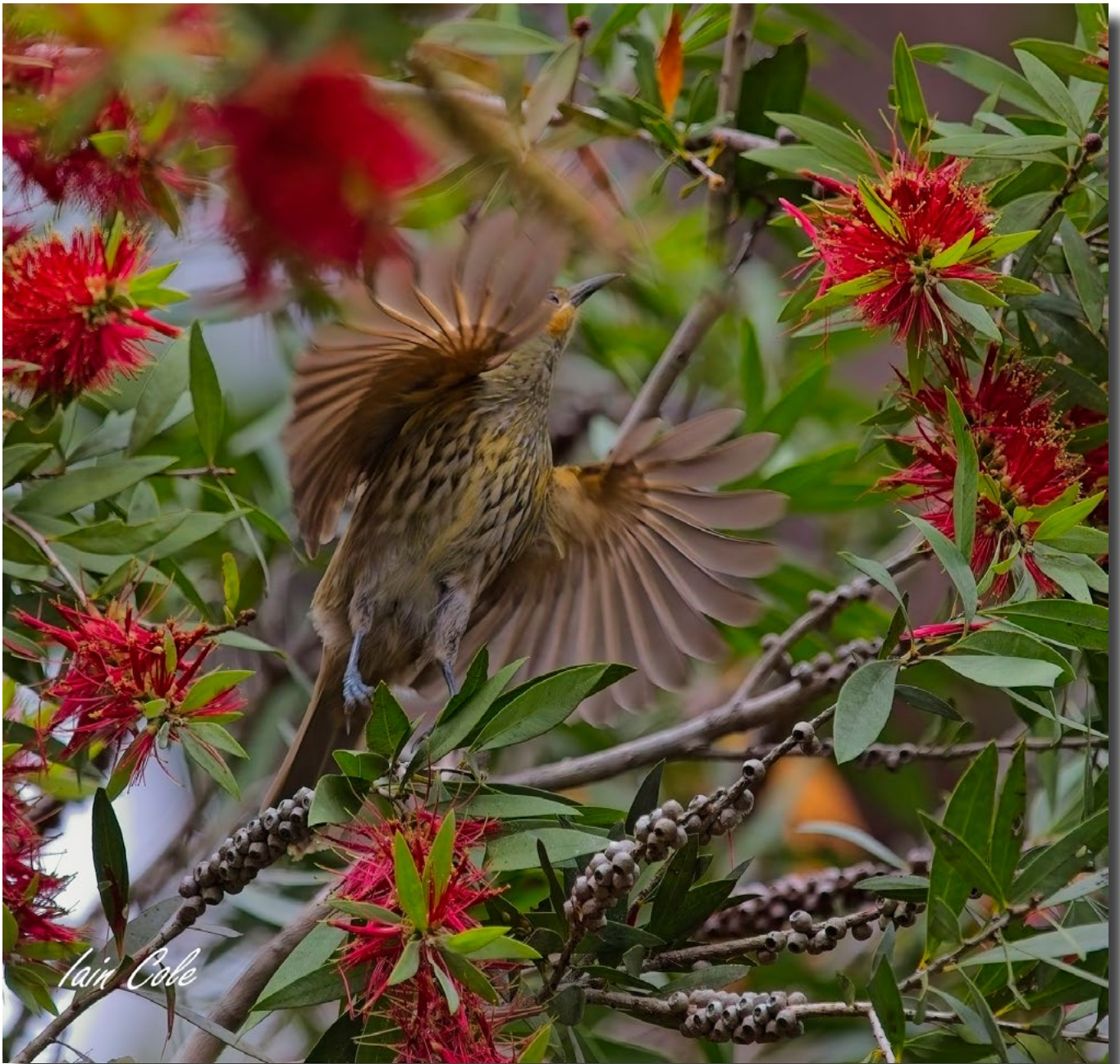
Startled. Macleay's Honeyeater. Murray Falls