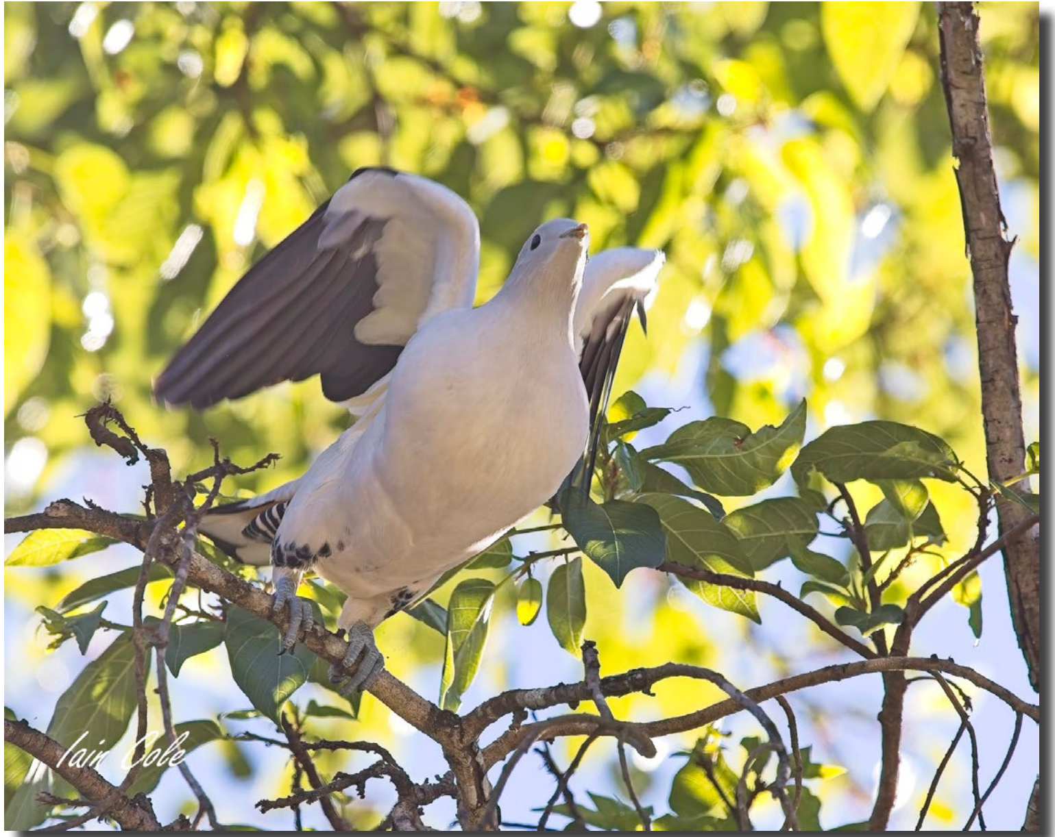
Pied Imperial Pigeon at Finch Hatton. First sighting Iain Cole