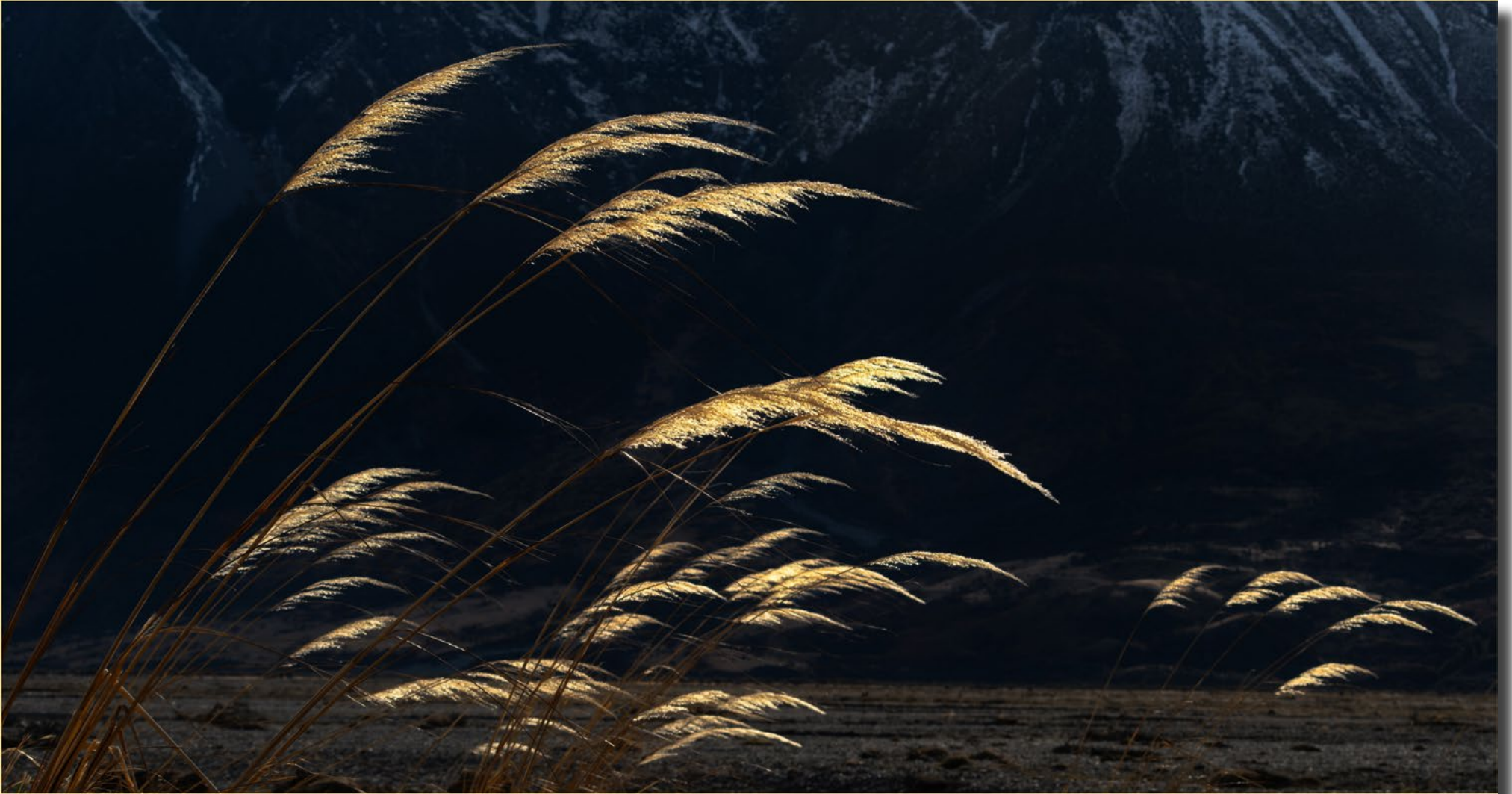
Sunlit Toetoe in the Hopkins Valley, New Zealand