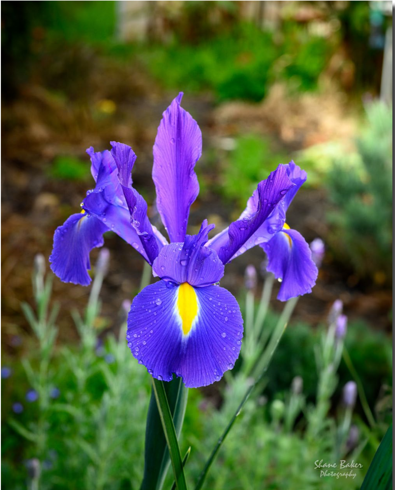
Dutch Iiis. Nikon Z9 with Nikkor Z24-70mm at 70mm, 1/100sec at F/11 and ISO450