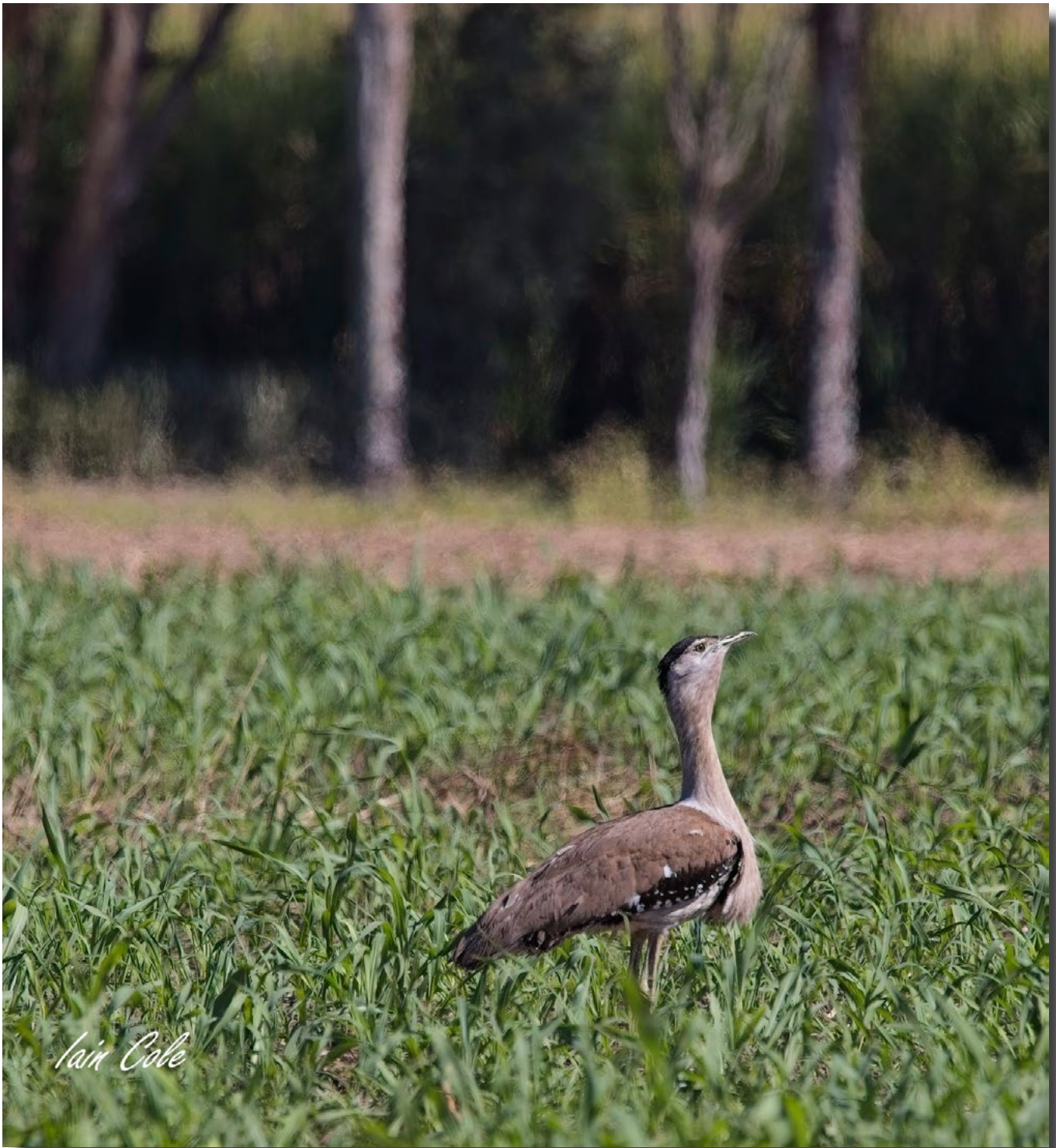
Australian Bustard in young cane field, Mirani. First sighting Iain Cole