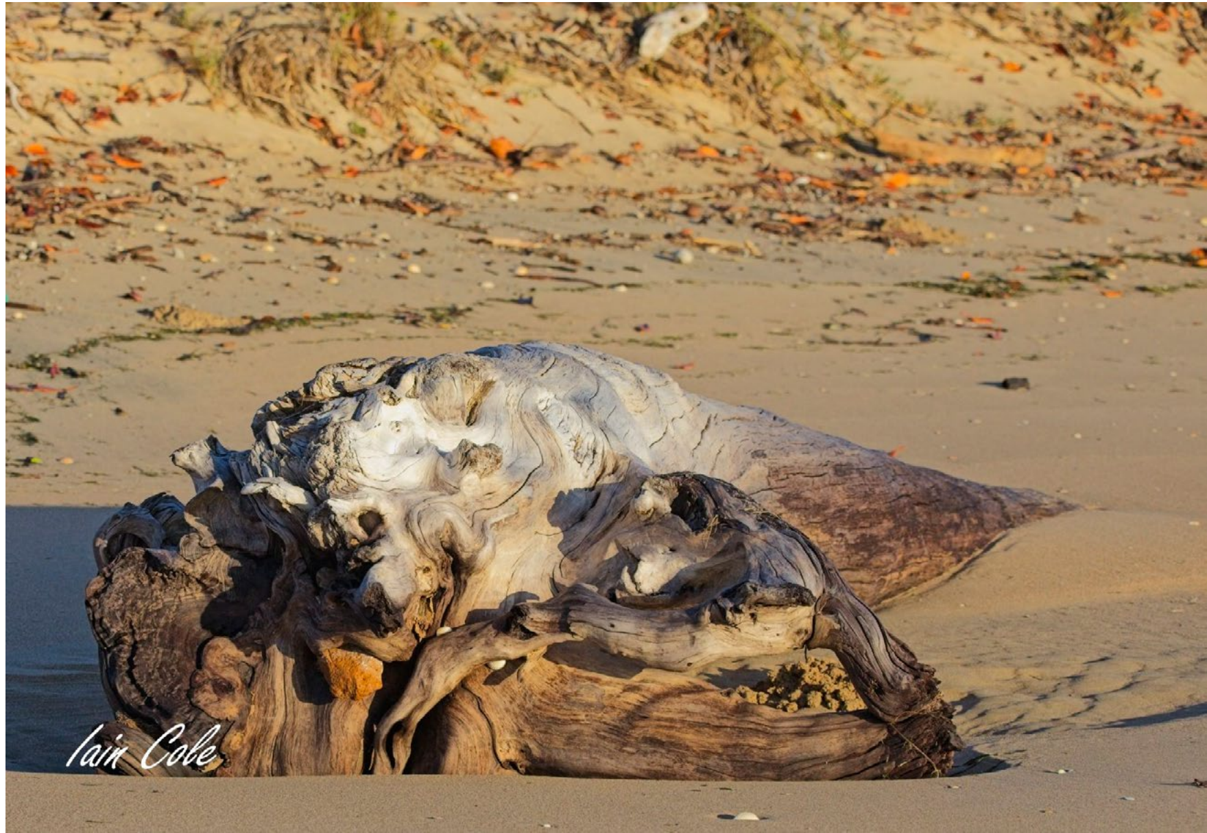
Where the Monsters Hide. Driftwood on the beach at Munjunga Iain Cole