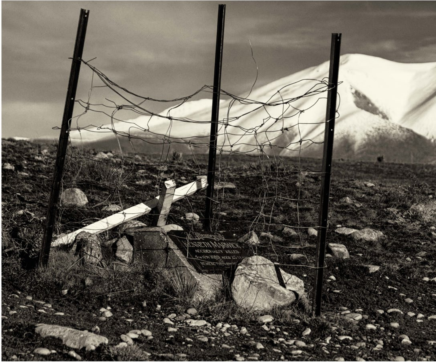
Fade to bleak, Canterbury Plains, New Zealand