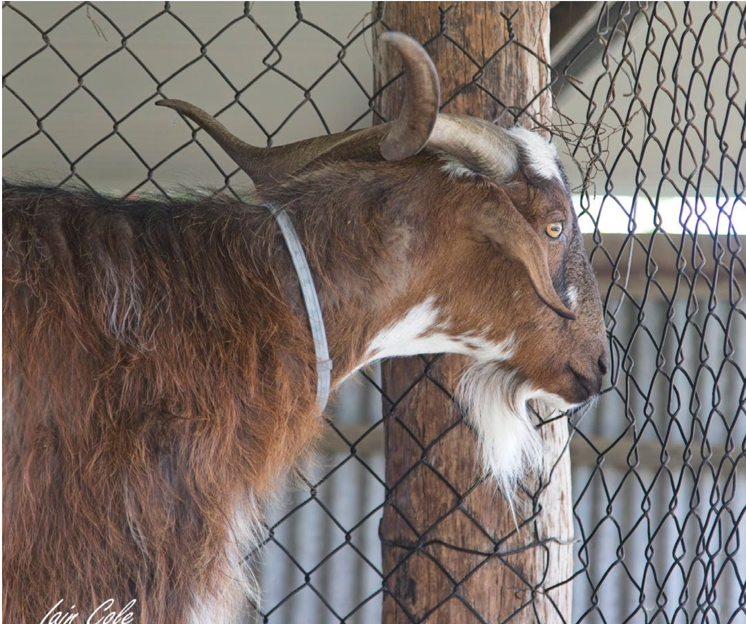
Voyeur. Watching the alpaca being shorn Iain Cole