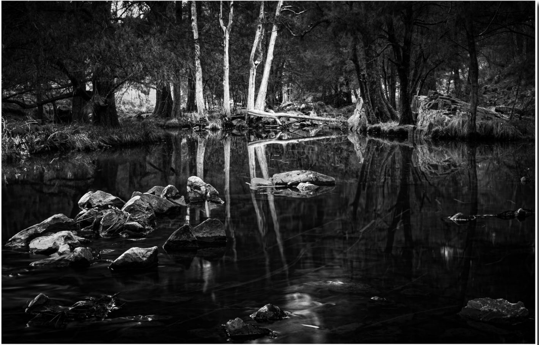
Dead Casuarina Ttees, Tuggeranong Creek