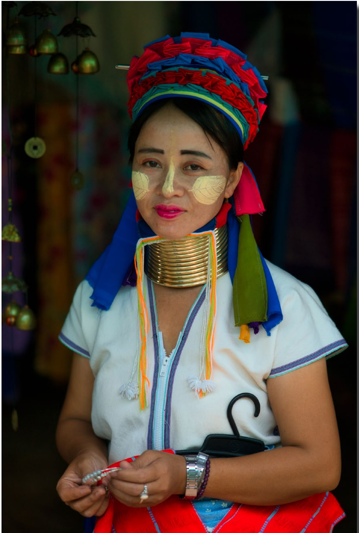
Karen Long Neck Village, Ban Huai Suea Thao, Mae Hong Son