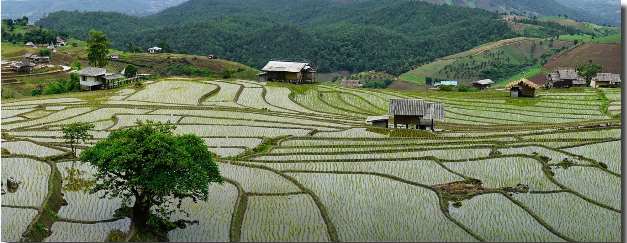
Panorama: Rice fields, Ban Pa Pong Piang, Chiang Mai