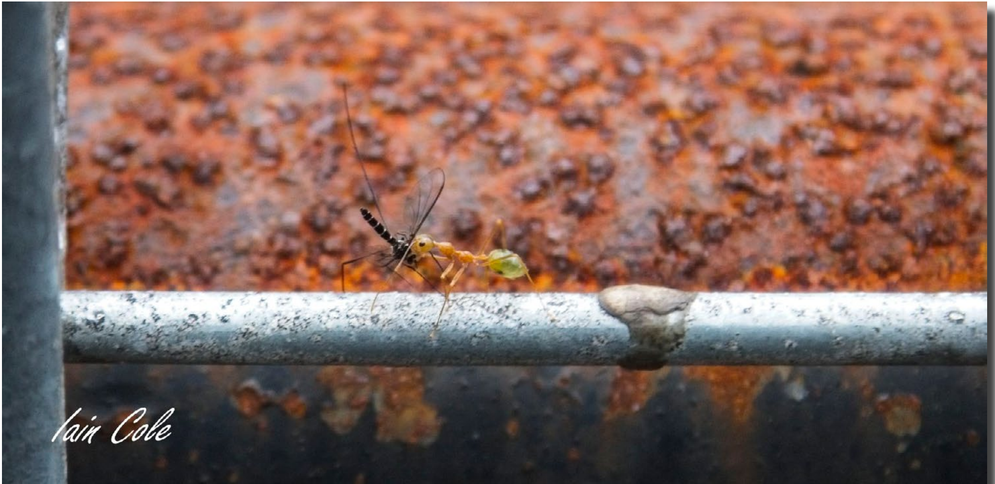
The cycle continues. Green Ant carrying prey to the nest Iain Cole