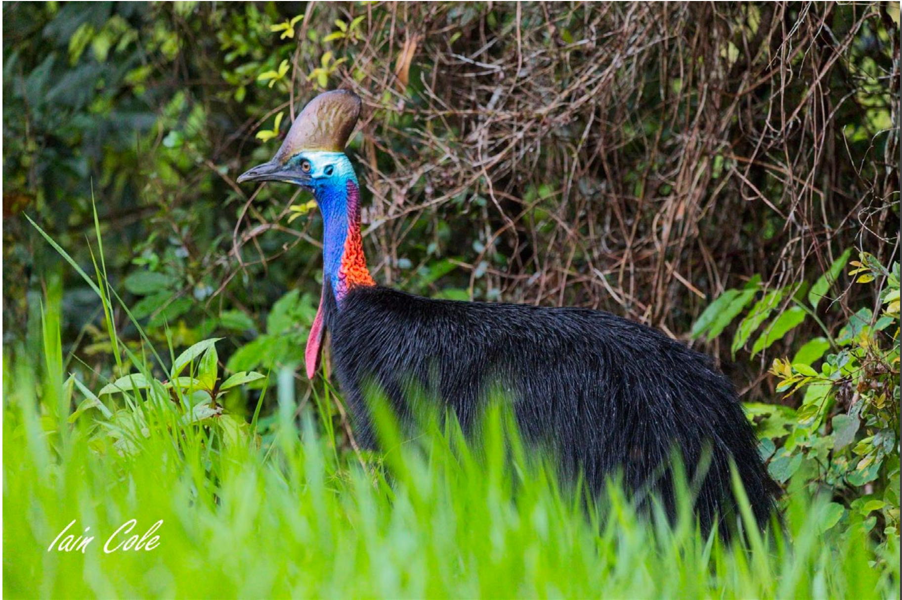
Rainforest Colours. Wild Cassowary at Babinda Boulders Iain Cole