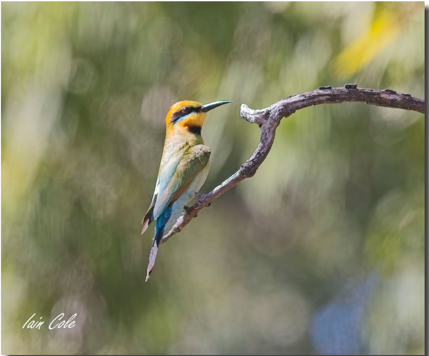
Posing in Profile. Rainbow Bee Eater at Munjunga Iain Cole