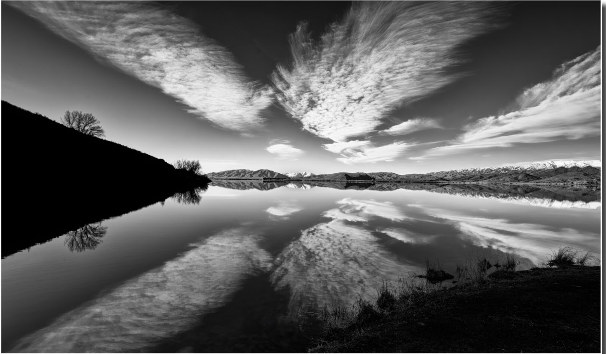
Harmonic reflections, Lake Benmore, New Zealand